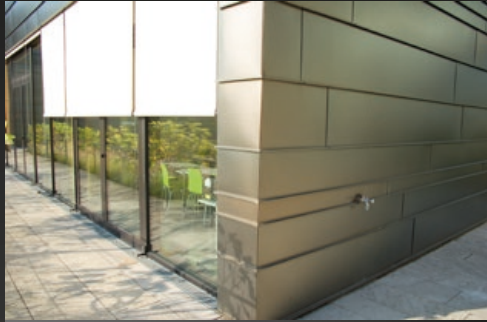
Facades on buildings