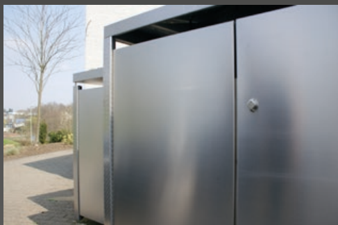
free design in the objekt area