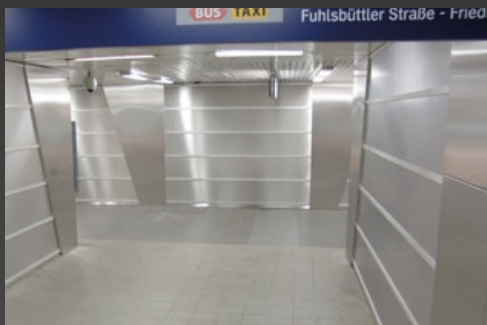
vandalism-safe in public areas